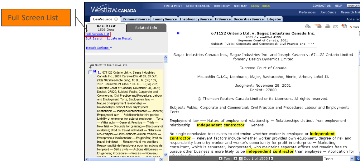
Figure 1: Split-screen view

To view the ResultsPlus for your search, click Full Screen List located in the upper left corner of the Result List tab.